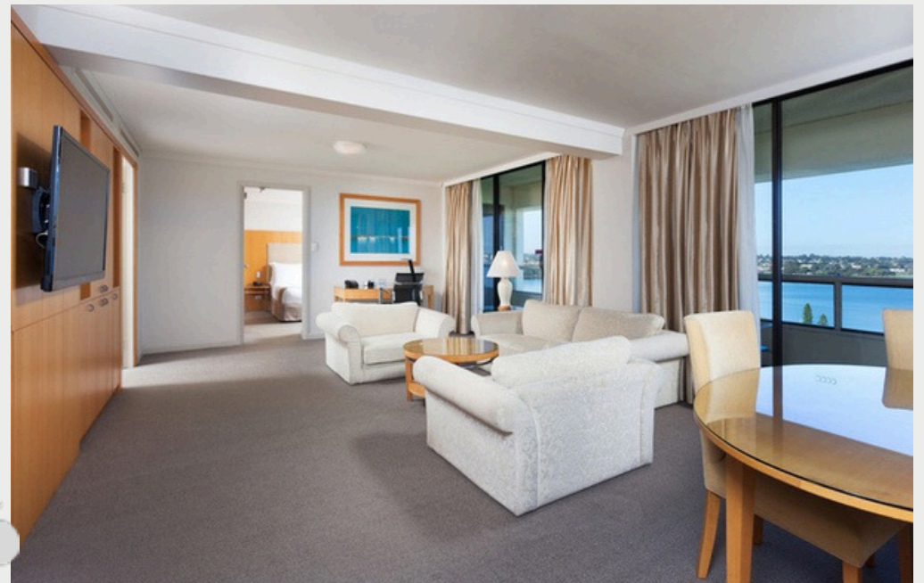
Living room of Crowne Plaza Perth's King Suite